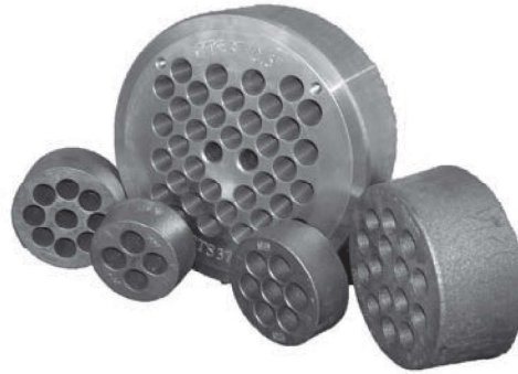
Anchor Heads - Many standard sizes available as well as any custom anchor head if required.