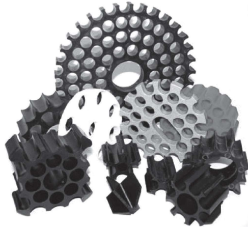
Organizers - Can be made to accommodate any size of anchor.