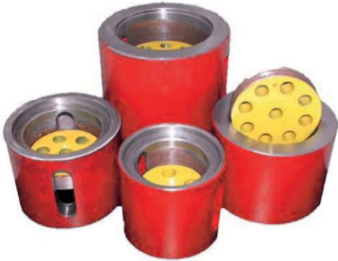
Adjustable Stressing Chairs - available in 4, 7, 9, 12 and 15 Strand sizes.