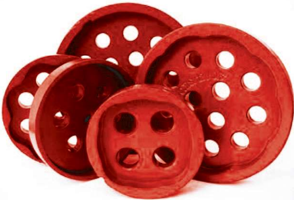
Restrainer Plates - Standard restraining plates are kept in stock in the 4, 7, 9, 12, and 15 strand sizes however, any other size can be fabricated to match the required anchor.